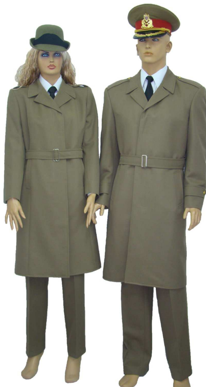
Ministry of National Defence, Land Forces, Overcoats