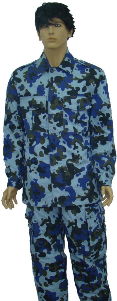
Romanian Intelligence Service, Summer Drill Uniform