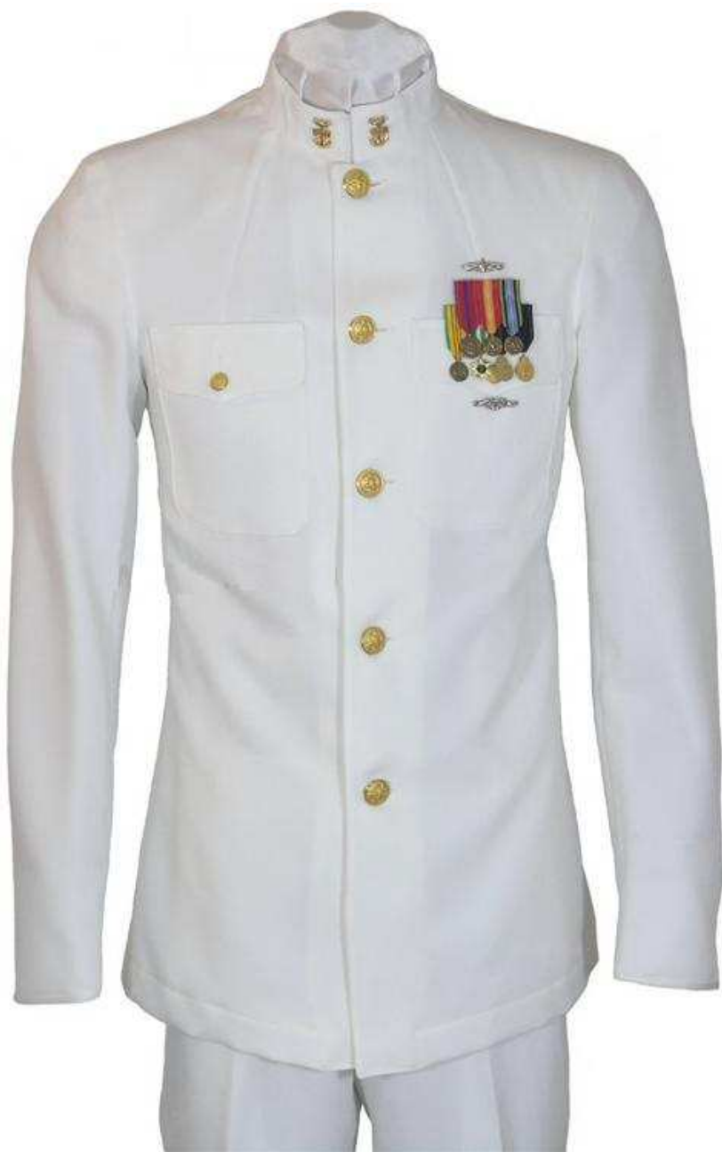
U.S. Navy Summer Dress White Uniform