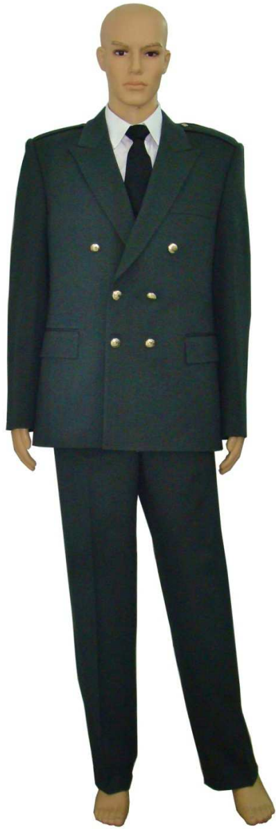
Romanian Intelligence Service, Men's Suit