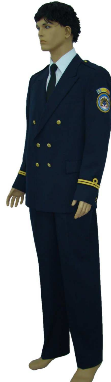
Protection and Guard Service, Men's Suit