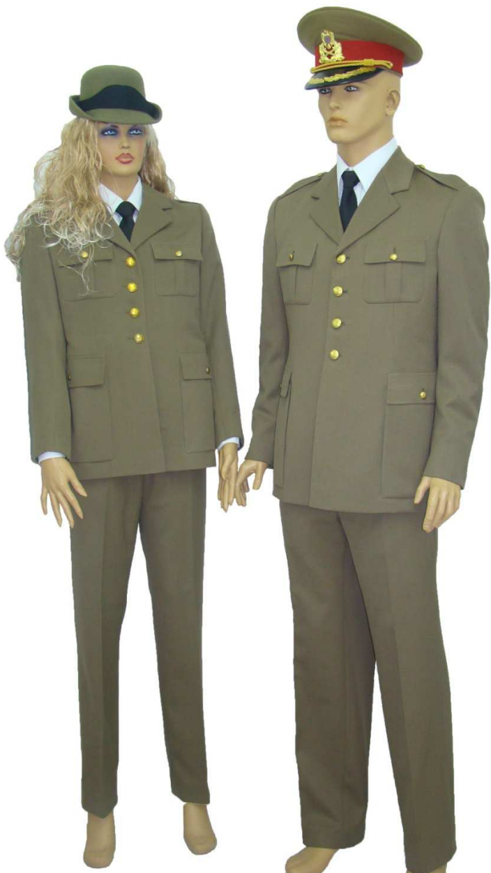
Ministry of National Defence, Land Forces, Suits