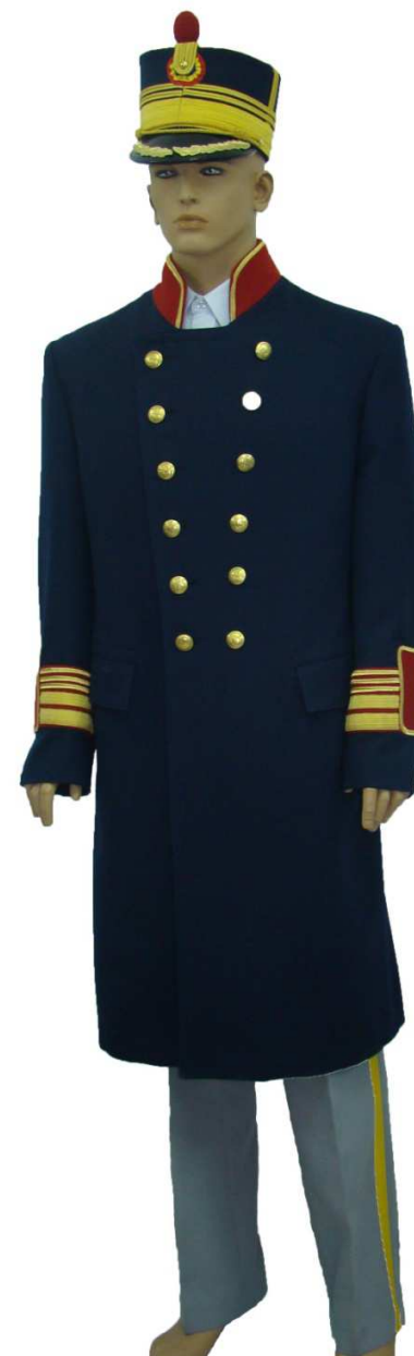
Ministry of National Defence, 30 th Guard and Protocol Regiment "Mihai Viteazul", Great Coat