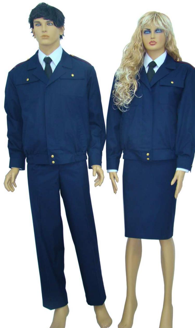
Ministry of National Defence, Land Forces, Student Uniforms