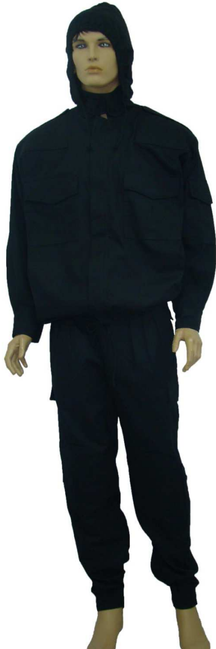
Romanian Intelligence Service, Drill Uniform