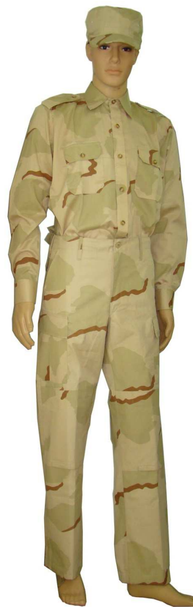
Ministry of Internal Affairs, Romanian Gendarmerie, Desert Drill Uniform