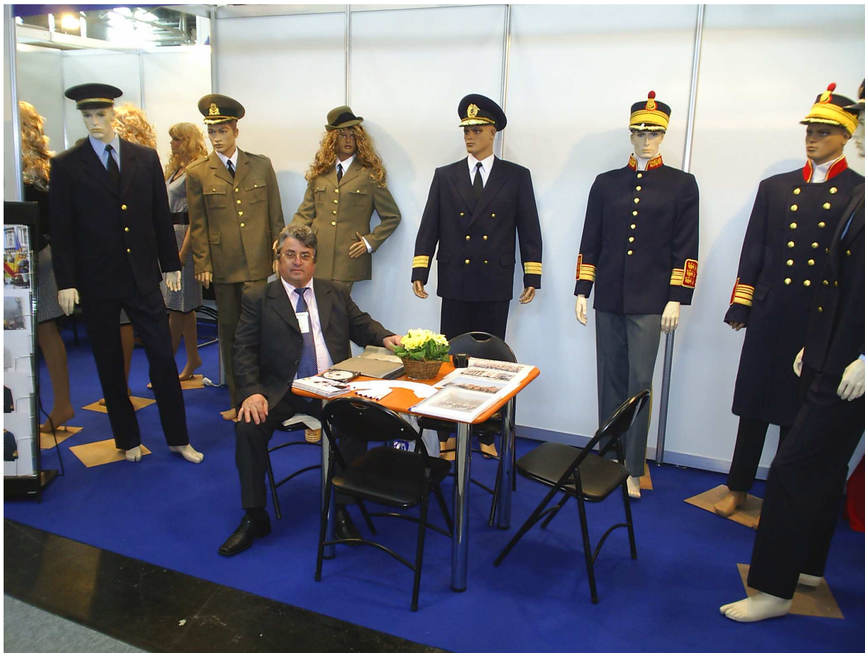
IHM – Internationale Handwerksmesse Munich 2008 fair