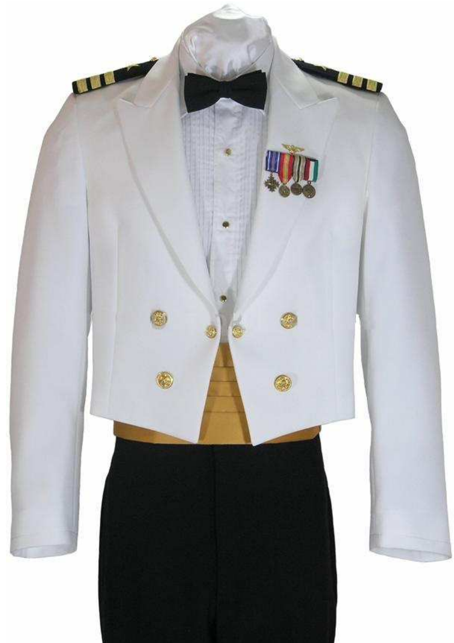
U.S. Navy Dinner Dress White Jacket