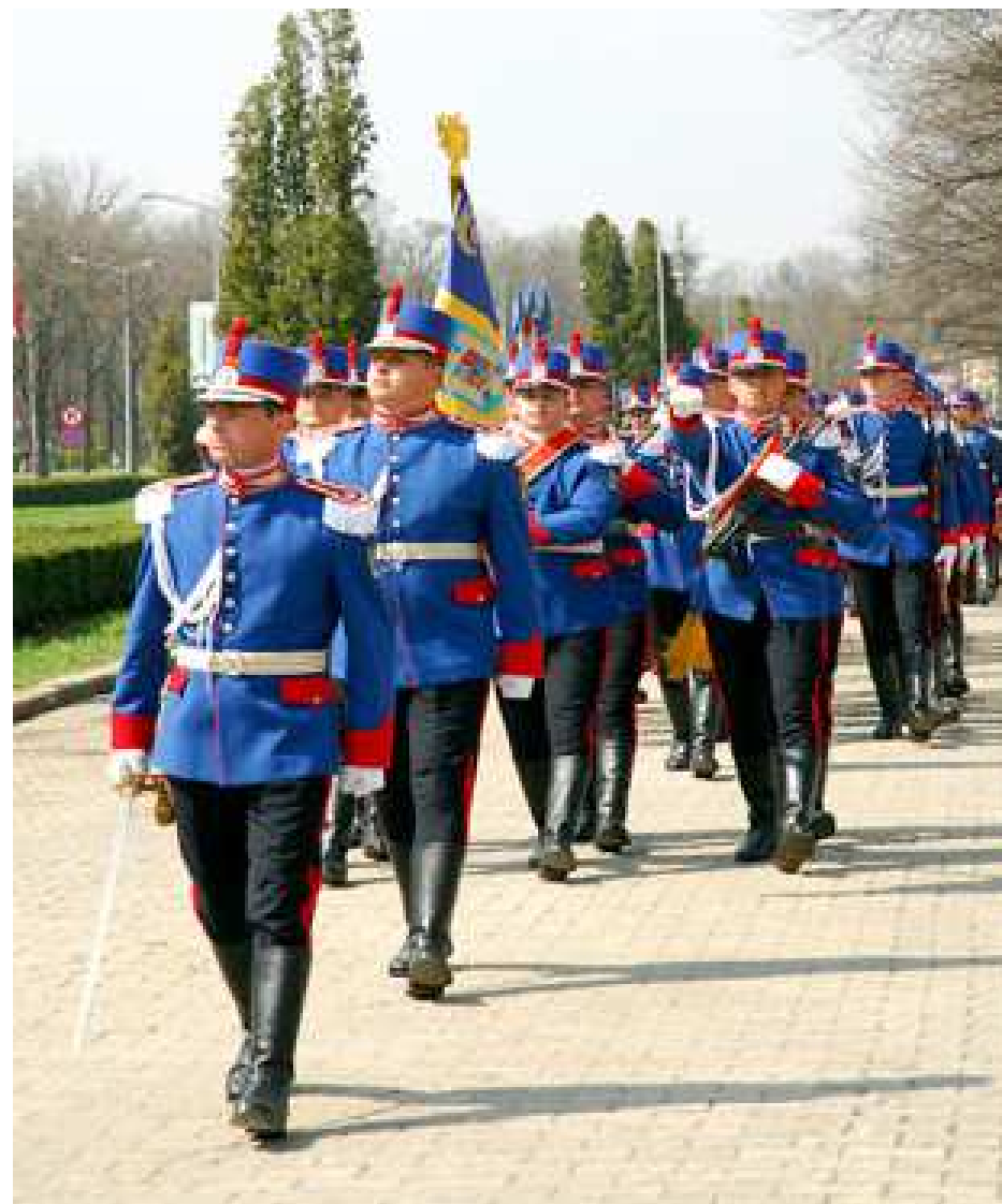
Ministry of Internal Affairs, Romanian Gendarmerie, Honor Guard, Suit