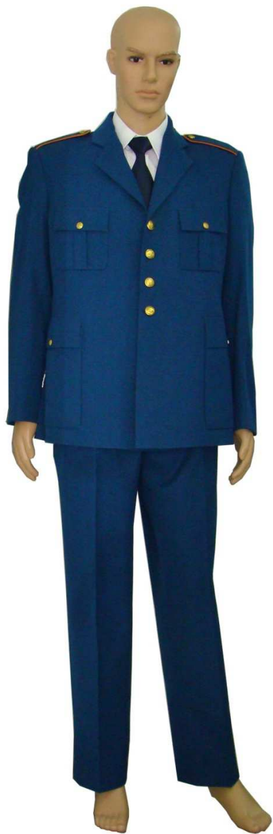
Ministry of National Defence, Air Forces, Suit