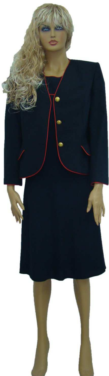
TAROM Romanian Air Transport, Stewardess Uniform