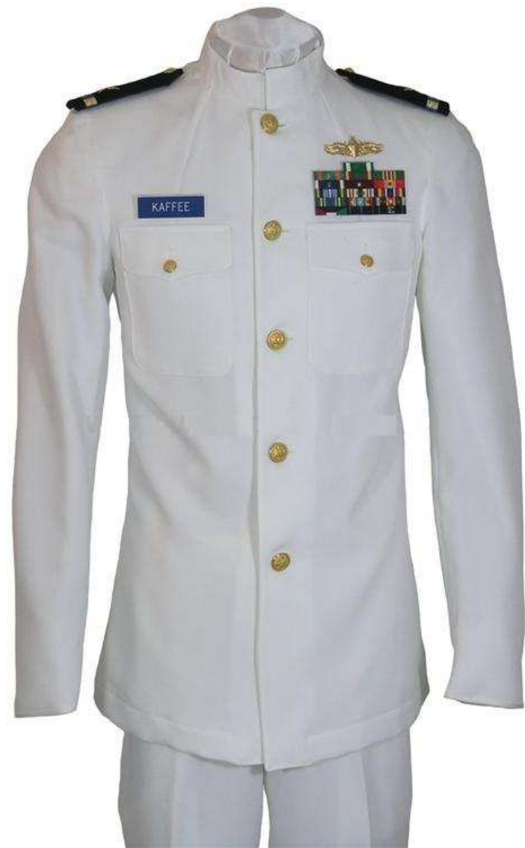
U.S. Navy Officer Dress White Uniform