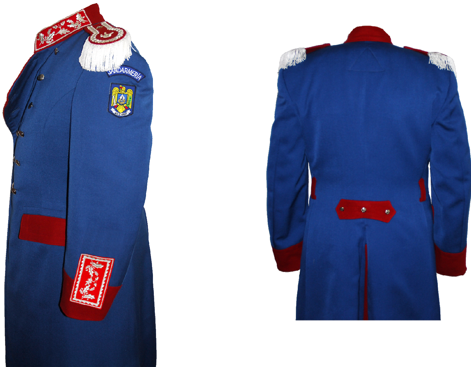
Ministry of Internal Affairs, Romanian Gendarmerie, Honor Guard, Great Coat