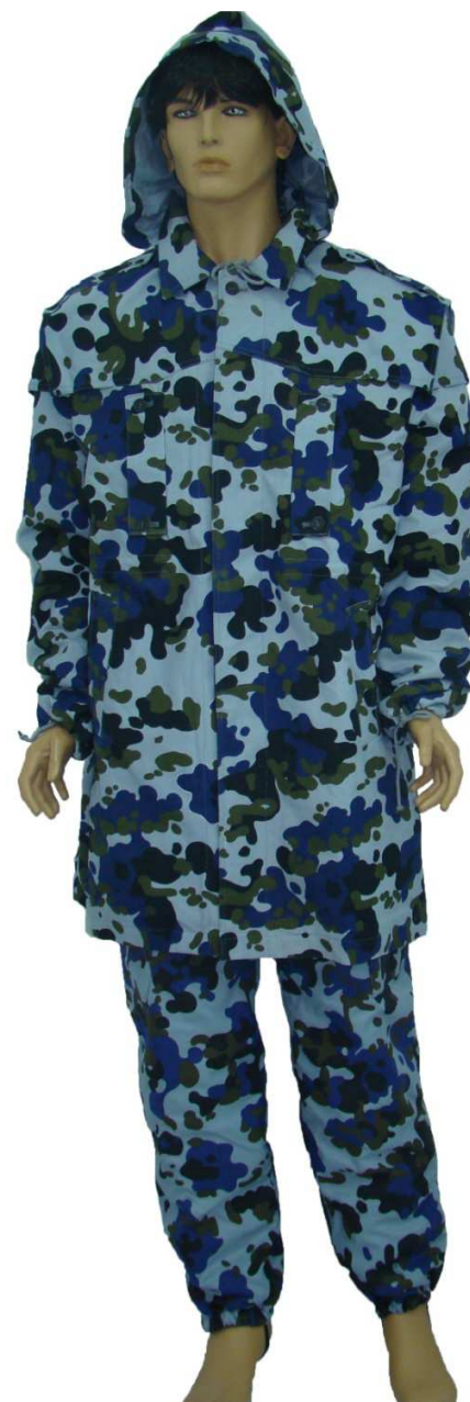
Romanian Intelligence Service, Winter Drill Uniform