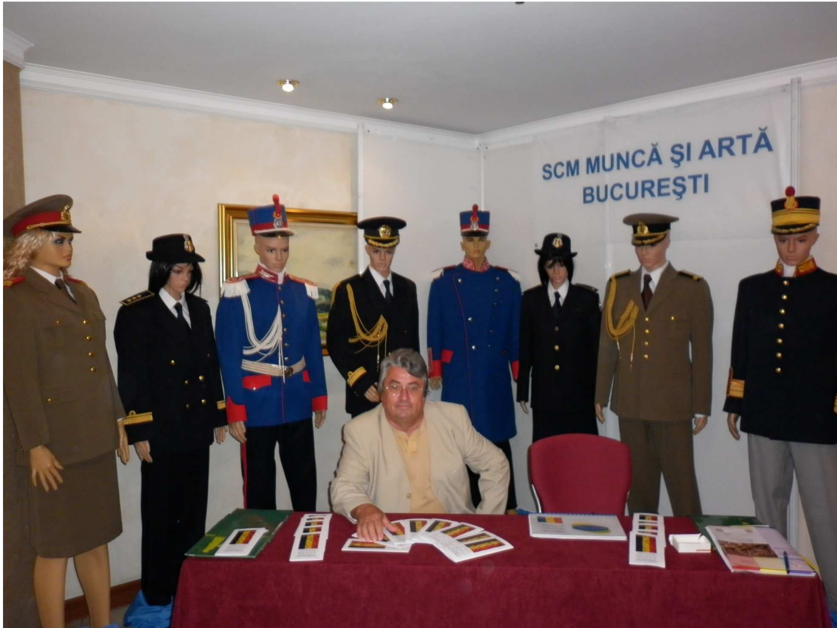
"DEVELOPMENTS IN PRISON AND PROBATION IN EUROPE: JOINT CHALLENGES, JOINT SOLUTIONS" Regional Conference of the ICPA (International Corrections and Prisons Association), 14-15 June 2012, Intercontinental Hotel, Bucharest, Romania