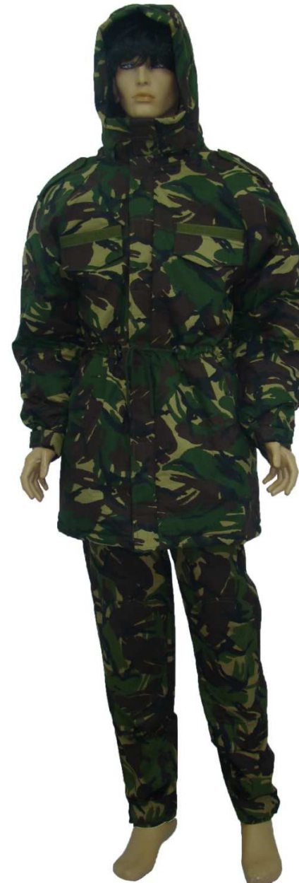
Ministry of National Defence, Land Forces, Winter Drill Uniform