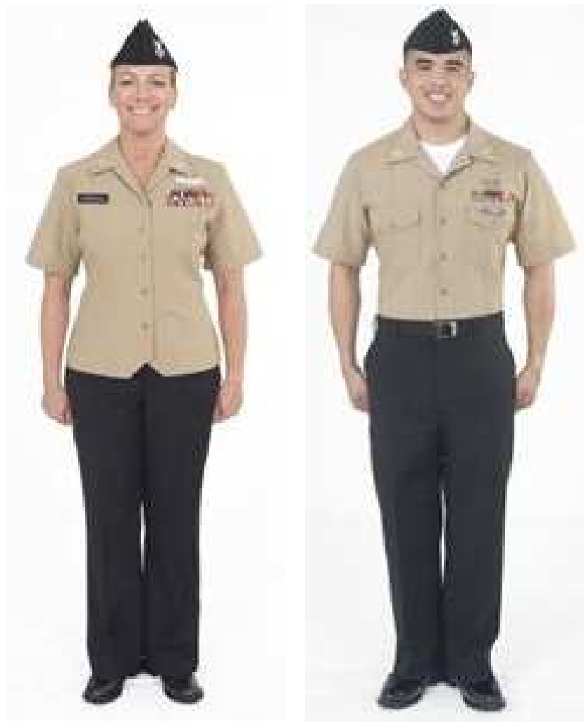
U.S. Navy Service Khaki Uniform