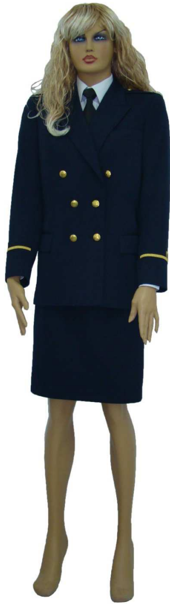
Protection and Guard Service, Women's Suit