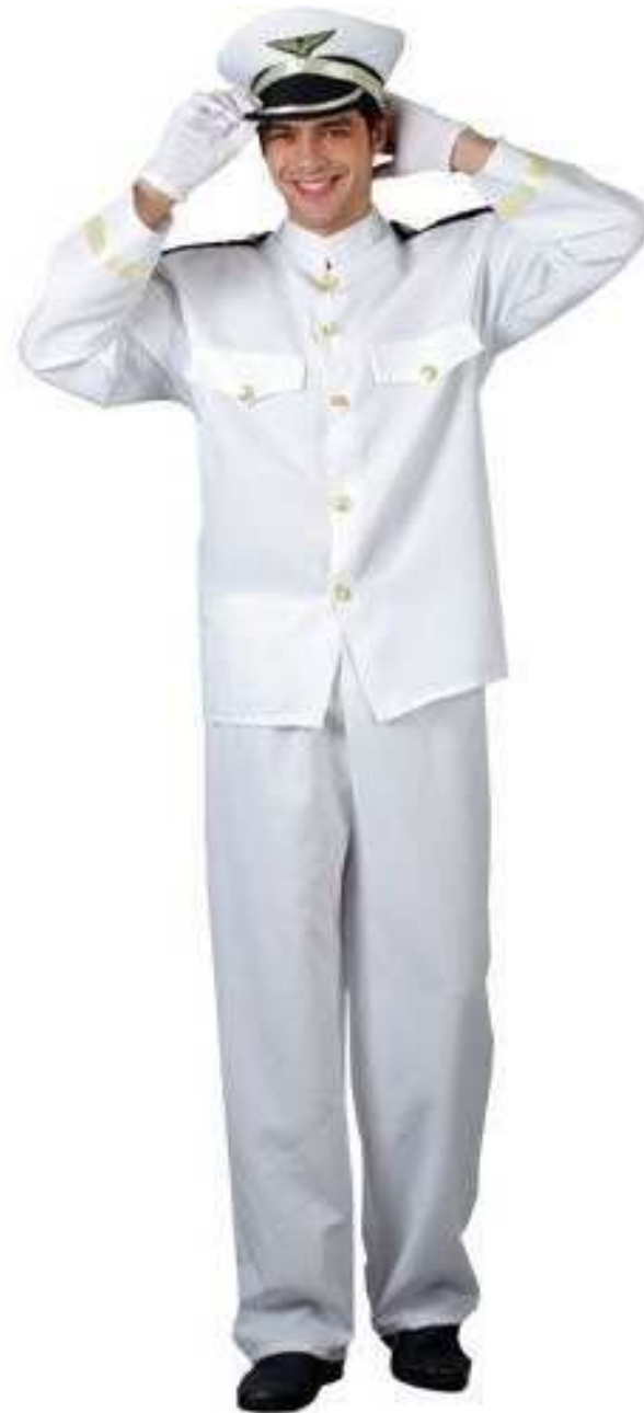
U.S. Navy Officer Dress White Uniform