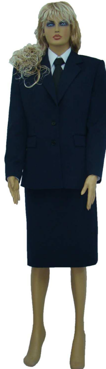
METROREX, Women's Suit