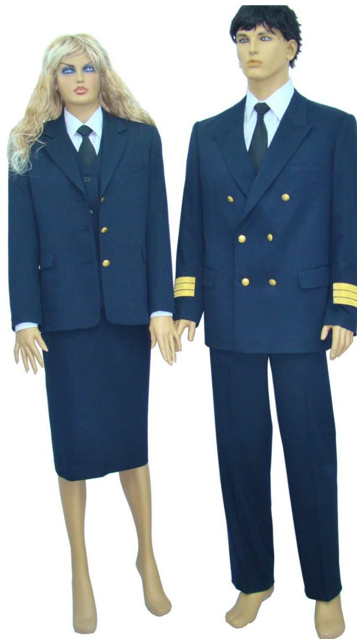
TAROM Romanian Air Transport, Air Crew Suits