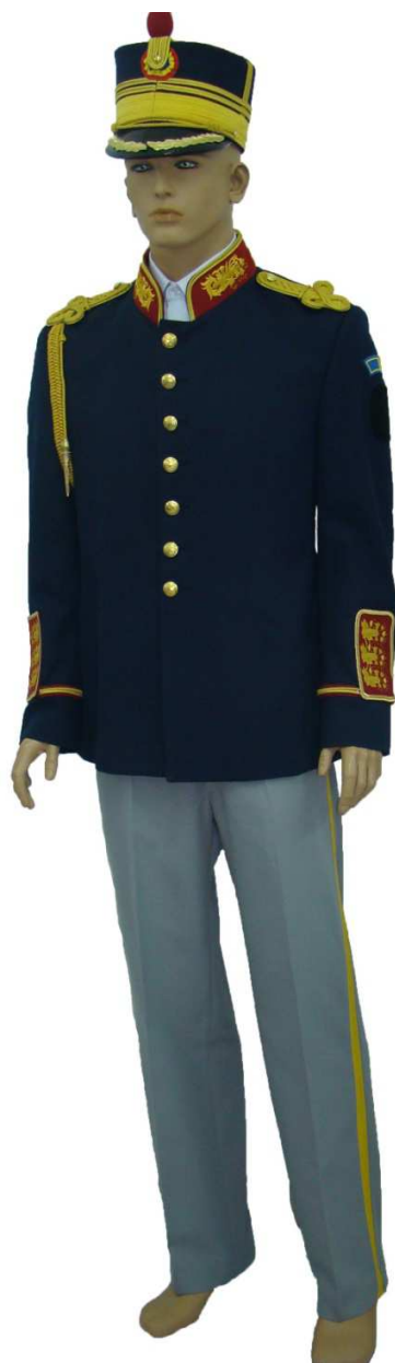
Ministry of National Defence, 30 th Guard and Protocol Regiment "Mihai Viteazul", Suit